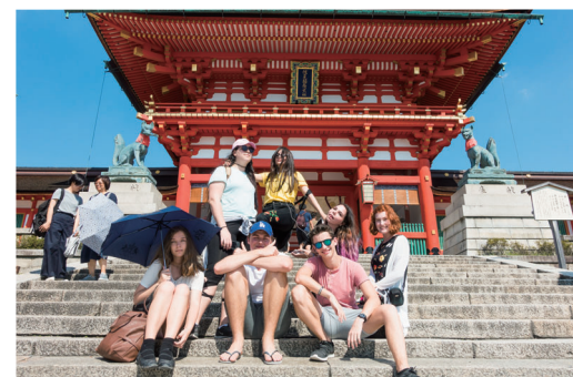
Trip to Kyoto