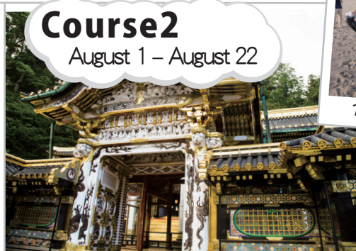
Trip to Nikko