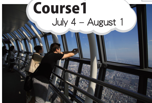
Tokyo Sky Tree