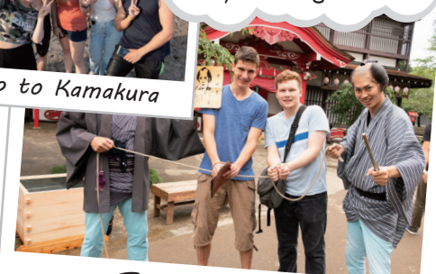
Trip to Nikko