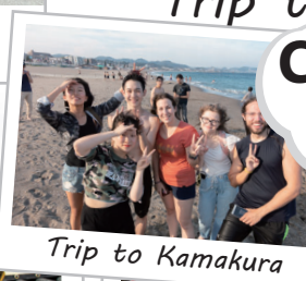
Trip to Kamakura