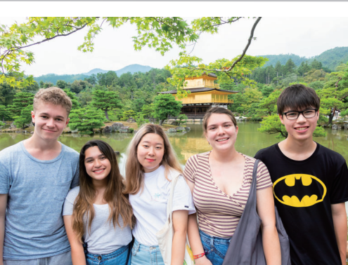
Trip to Kyoto

Present Yukata (Summer Kimono) for all participants!!